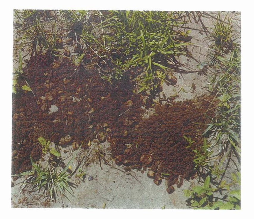
Photo 1 : Dung buried by O. gazella and O. alexis. The age of the pad was estimated to be less than 24 hours.