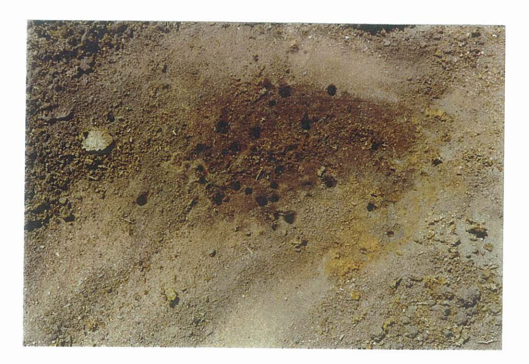
Photo 2 : Dung has been scraped aside, revealing some O. gazella and O. alexis holes. These demonstrate the aeration effect of dung beetles.